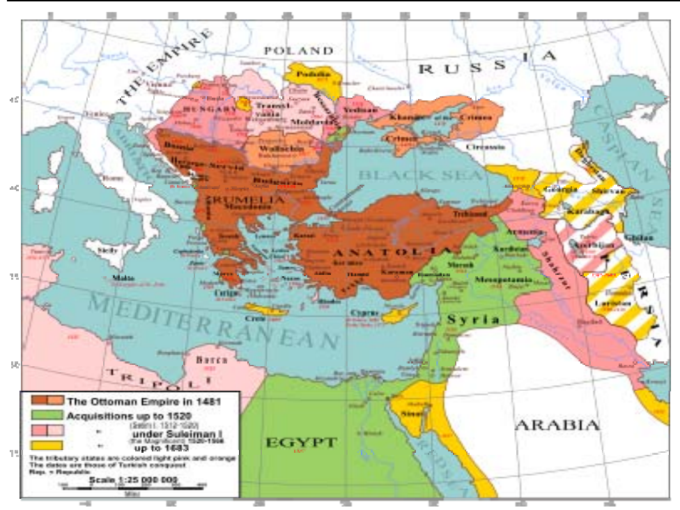
The Ottoman Empire in 1441

In Wikipedia, Free Encyclopedia, the Eastern Question is described as follows: